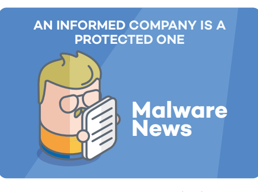
Educate your employees periodically about the dangers and evolution of malware.

Phishing knows no boundaries and can reach you in any language.