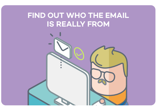
Your bank will never ask you to send or confirm your password or personal information via email.

Use the advanced security solution that best fits your company's needs.