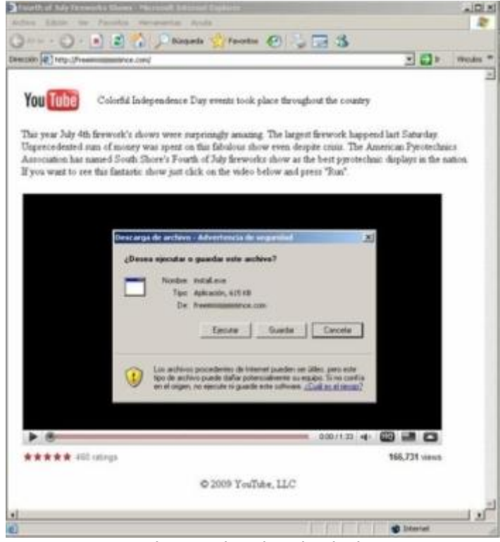
Fig. 9 Web page that downloads the worm

In order to watch the video, the user is asked to install a file. However, the file is in reality a copy of the worm.