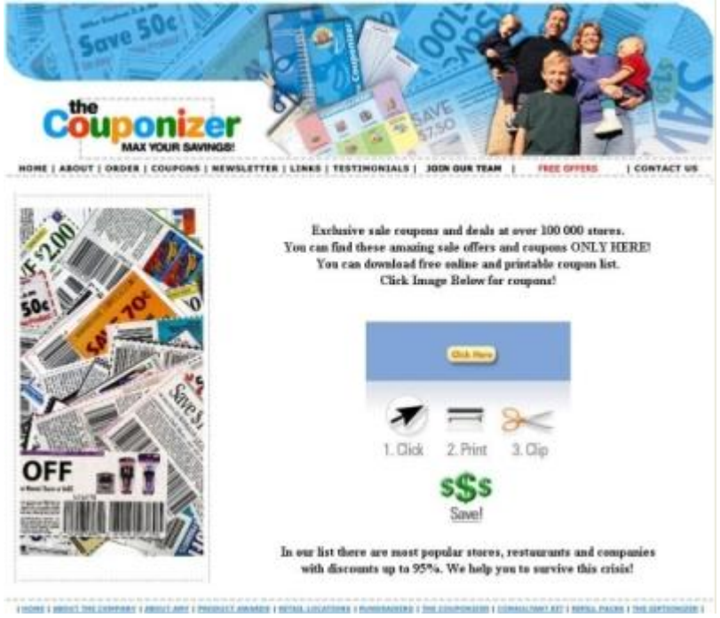
Fig. 6 Web page supposedly offering discount coupons

Users that tried to download these coupons by clicking the links on the page would actually be downloading files with plausible names such as couponlist.exe, coupons.exe, list.exe or print.exe. Yet again, the files were actually copies of the worm.