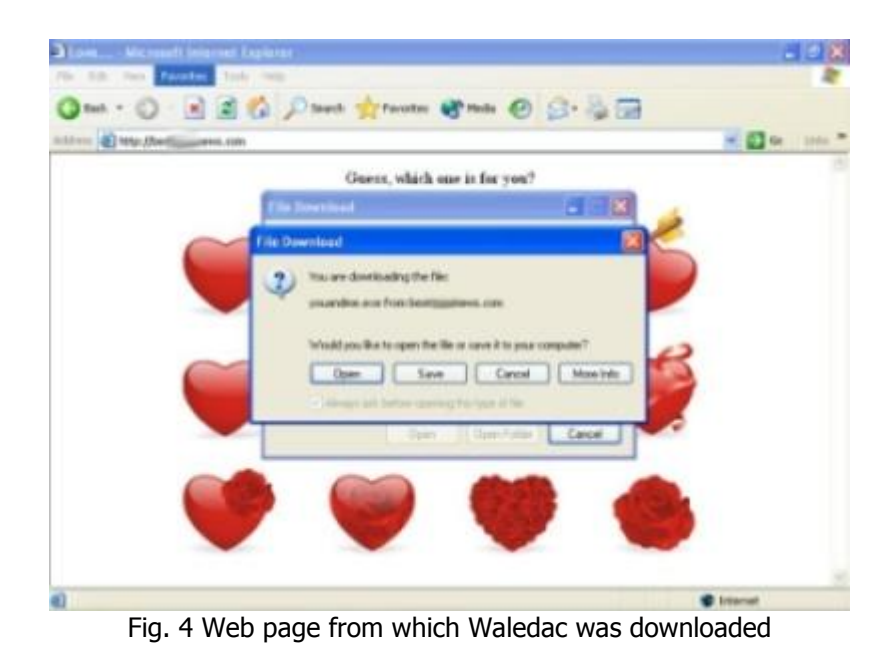
© Panda Security 2009 | PandaLabs www.pandasecurity.com/homeusers/security_info | www.pandalabs.com

In this case, the email contained a link to a Web page with images of hearts. Users were then prompted to click one of them. Needless to say, this would result in the malicious file being downloaded onto their computers as the file was, in fact, a copy of the worm.